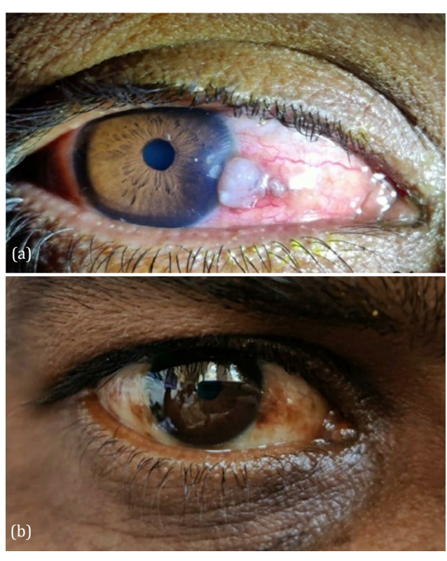
Figure 3: Before (a) and after (b) treatment with MMC.

Eye irritation was the common side effect noted (p=0.34). This was managed with carboxymethyl cellulose 0.5% eye drops and loteprednol 0.5% eye drops. The side effects were transient and resolved with the discontinuation of topical chemotherapy (Figure 3). No cases of punctual stenosis or corneal ulceration were observed. No patient discontinued therapy due to side effects. No tumor recurrence was noted in any patient.