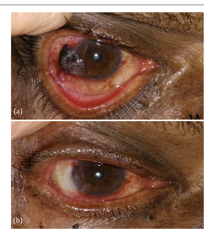
Figure 2: Before (a) and after (b) treatment with MMC.

Complete tumor regression by topical treatment alone was achieved in 6(54.5%) patients (p=0.05). Partial tumour resolution was seen in 5 patients (Figure 2). The mean duration for complete tumour regression was 6 weeks (p=0.03).