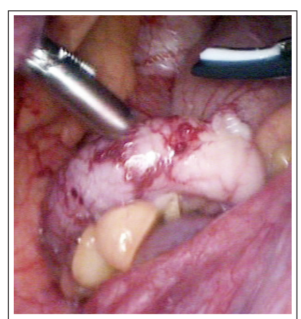
Figure 2: Right & left hand instruments with inflamed appendix.

Fetal heart rate was 146/min in immediate postoperative period. There was no uterine activity in immediate postoperative period and no obstetric or surgical complication occurred. Patient was discharged after 72 h. Histopathological results confirmed inflamed appendix. Weekly follow ups were done and pregnancy progressed in satisfactory manner. At 38 weeks of gestation, patient delivered an alive female baby by elective LSCS which was uneventful.