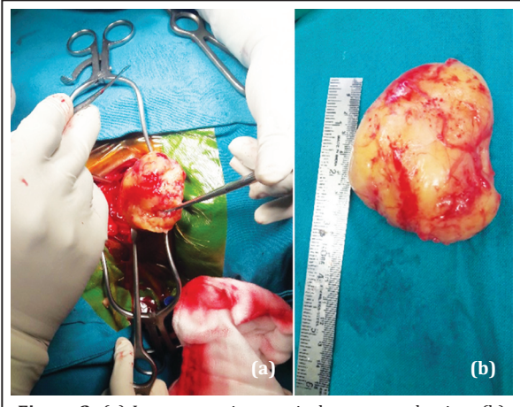
Figure 2: (a) Intra operative surgical mass enucleation, (b) Excised lump.

Surgery was done under general anaesthesia and a lazy S shaped incision extending over the clavicle was made over the swelling. Incision deepened layer by layer, swelling was identified and separated from surrounding structures very carefully. Mass separated from the nerve sheath of the nerve passing beneath it carefully and was excised completely without any injury to the nerve (Figure 2). A suction drain was kept in situ.