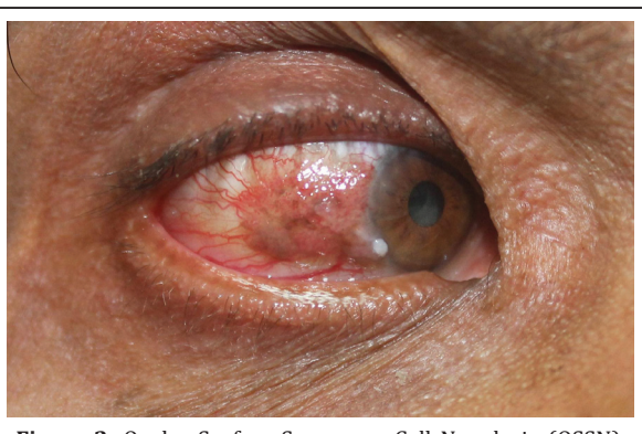
Figure 2: Ocular Surface Squamous Cell Neoplasia (OSSN). Note the tortuous dilated feeder vessels leading up to the mass. This is a mixed (gelatinous and papilliform) intraepithelial type of OSSN.

A/G polymorphism was seen in 4 out of 12 cases of OSSN, in 13 out of 20 cases of cataract, while this was reported in 47 of 103 healthy individuals. The 95%