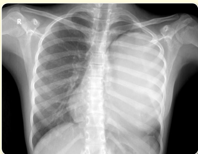
72.. Spontaneous rupture of giant hydatid cyst of lung into left bronchus....