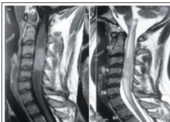
Figure 3ab: MR spine – An elongated cylindroid space occupying lesion in cervical cord

Post operatively, MRI brain and screening of entire spine was done which revealed residual lesion in suprasellar region and interpeduncular cistern. Another intramedullary lesion at C3-C4 level was detected causing focal cord expansion and displacement of cord anteriorly suggesting metastasis.