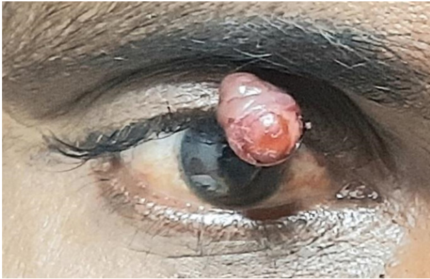
Figure 1: Pre-operative picture.

of a +1.00 dioptre lens. Differential diagnoses were capillary haemangioma, molluscum contagiosum, ruptured chalazion granuloma, pilomatricoma, basal cell carcinoma, and squamous cell carcinoma. Informed consent was taken.