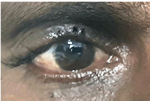
Figure 2: Post-operative picture.

A complete excision biopsy of the mass performed with a margin of 4mm, and the skin defect was closed with interrupted sutures (Figure 2). A histopathological examination conducted on the excised mass.