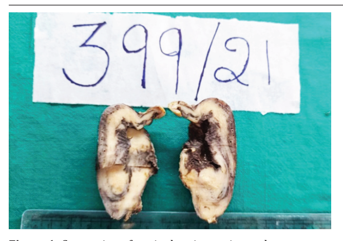
Figure 1: Cut section of testis showing variegated appearance with specks of calcification.