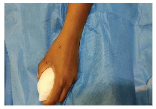
Figure 1: Presence of an appropriate distal radial pulse in the ASB verified by palpation. Roll of gauze grasped to favor a shift of the distal radial artery to the surface of the radial fossa.

and semiflexion of wrist with semipronation of the forearm. After local anesthesia the artery was punctured with a 21G needle at an angle of 35-45 degrees. Through the puncture needle a guide wire is inserted. Over the guidewire a radial hydrophilic sheath is introduced. To prevent arterial spasm nitroglycerine (100mcg) and unfractionated heparin (5000 IU) was given through the sheath. Through this radial sheath the PCI was performed. Post PCI sheath removed, and elastic compressor bandage was applied. (Figures 1-5). All patients were evaluated at 4 - 6 hours. On removal of compressor bandage the presence of a palpable distal radial pulse and hematomas were noted. In the absence of a palpable radial pulse, distal RAO was considered present.