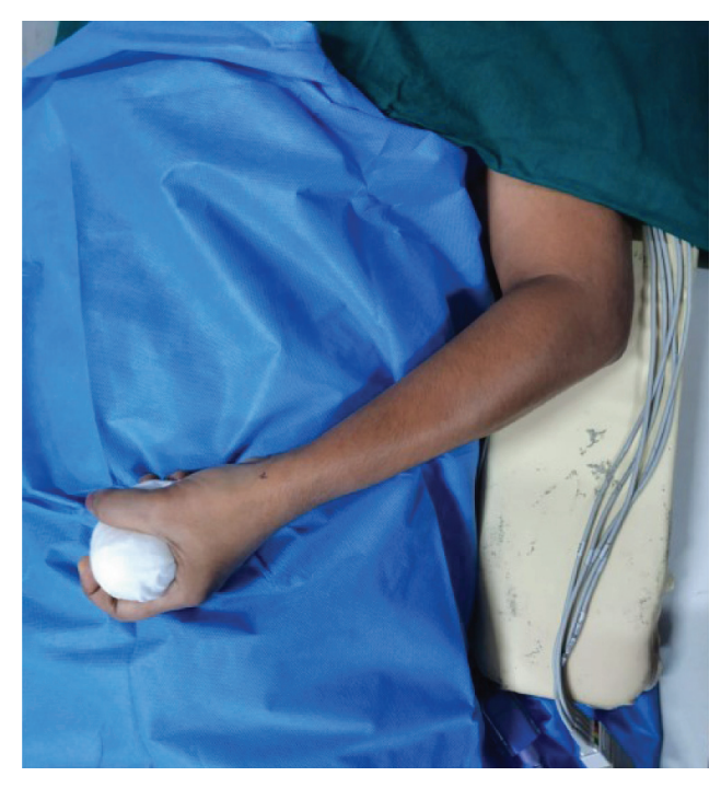
Figure 2: The left forearm was positioned on the groin while applying ulnar deviation and semi-flexion position at the wrist and semipronation of the forearm.