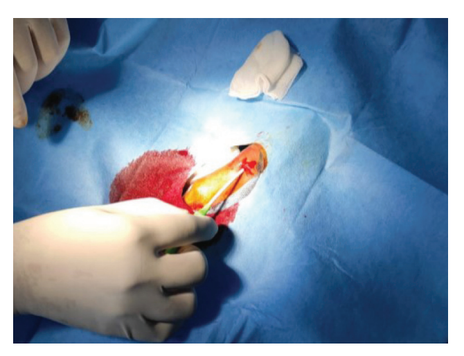
Figure 4: Introducer sheath being inserted.